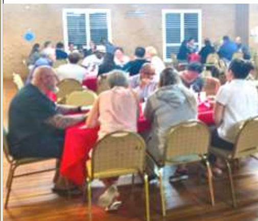
Some of the participants at Alpha launch night

This weekend, we will celebrate the Alpha team. This is a group of people who have a passion for sharing their faith with others, drawing upon the Holy Spirit and using the tools in our parish vision of Evangelisation, Community, Discipleship, Worship, Ministry and Leadership.