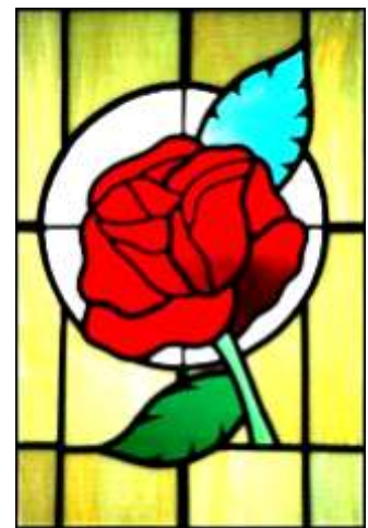
The rose, a symbol for joy.” St. James Catholic Church, Dawson, Minnesota.

Joyful Scripture Texts. In the first reading Isaiah says that he was sent “to bring glad tidings” (Is 61:1) and that “my God is the joy of my soul” (Is 61:10); in the Responsorial Psalm the Blessed Virgin Mary prays, “My spirit rejoices in God my Savior” (Lk 1:47); and in the second reading St. Paul insists that we should “rejoice always” (1 Thes 5:16). The gospel is John the Baptist’s joyful declaration that he was sent by God to testify to the light, the one who is coming after him, the Christ! (Jn 1:7,27).